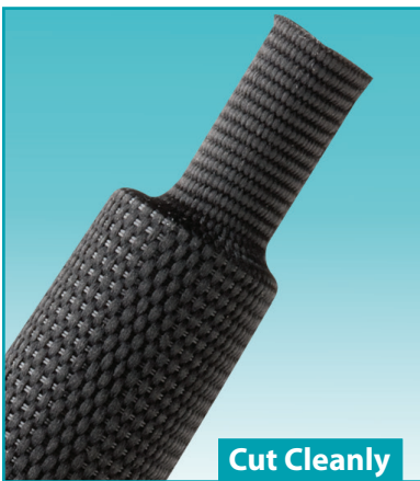
Cut Cleanly Scissor