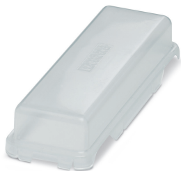
Protective covers, type: B24, degree of protection: IP20, color: transparent/white

Please be informed that the data shown in this PDF Document is generated from our Online Catalog. Please find the complete data in the user's documentation. Our General Terms of Use for Downloads are valid ( http://phoenixcontact.com/download )