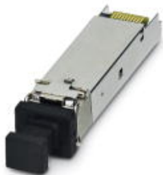
Gigabit SFP module for transmission up to 30 km with a wavelength of 1310 nm.

Please be informed that the data shown in this PDF Document is generated from our Online Catalog. Please find the complete data in the user's documentation. Our General Terms of Use for Downloads are valid ( http://phoenixcontact.com/download )