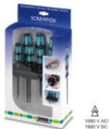
Screwdriver set, bladed/crosshead Phillips Recess®, VDE insulated, 6-part, incl. rack

Please be informed that the data shown in this PDF Document is generated from our Online Catalog. Please find the complete data in the user's documentation. Our General Terms of Use for Downloads are valid ( http://phoenixcontact.com/download )