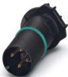
Sensor/actuator flush-type plug, 4-pos., A-coded, with straight THR solder connection, only contact insert

Please be informed that the data shown in this PDF Document is generated from our Online Catalog. Please find the complete data in the user's documentation. Our General Terms of Use for Downloads are valid ( http://phoenixcontact.com/download )