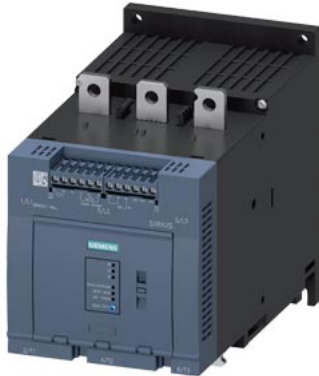
SIRIUS soft starter 200-600 V 570 A, 110-250 V AC Screw terminals Analog output