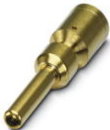
Crimp contact, turned, Single contact, contact diameter: 3.6 mm, crimp range: 16 mm 2 ... 16 mm 2

Please be informed that the data shown in this PDF Document is generated from our Online Catalog. Please find the complete data in the user's documentation. Our General Terms of Use for Downloads are valid ( http://phoenixcontact.com/download )