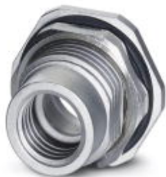
M8 socket, rear mounting

Please be informed that the data shown in this PDF Document is generated from our Online Catalog. Please find the complete data in the user's documentation. Our General Terms of Use for Downloads are valid ( http://phoenixcontact.com/download )