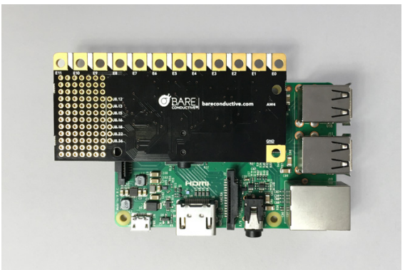
The Pi Cap works with Raspberry Pi A+, B+, Zero and later.