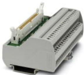
VARIOFACE interface module, with LED, for 32 channels

Please be informed that the data shown in this PDF Document is generated from our Online Catalog. Please find the complete data in the user's documentation. Our General Terms of Use for Downloads are valid ( http://phoenixcontact.com/download )