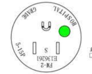
插頭端面圖 (Dimensions of Plug Face)