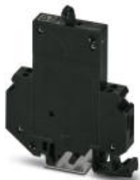
Thermomagnetic circuit breaker, 1-pos., normal blow, 1 N/C contact, with universal foot for mounting on NS 32 or NS 35

Please be informed that the data shown in this PDF Document is generated from our Online Catalog. Please find the complete data in the user's documentation. Our General Terms of Use for Downloads are valid ( http://phoenixcontact.com/download )