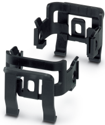
Connection element, type: B6 - B24

Please be informed that the data shown in this PDF Document is generated from our Online Catalog. Please find the complete data in the user's documentation. Our General Terms of Use for Downloads are valid ( http://phoenixcontact.com/download )