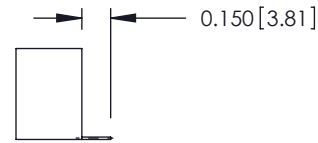
554 Contact Code