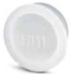
Plastic dust protection cap for connectors with M23 knurled nuts

Plastic dust protection cap - RC-Z2058 - 1604223