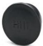
Plastic dust protection cap, anti-static, for RF, SF series connectors, with M23 external thread

Plastic anti-static dust protection cap - RC-Z2469 - 1611797