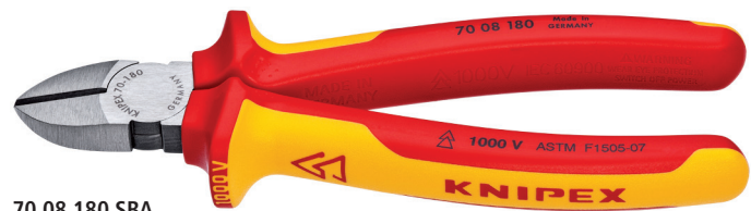
70 08 180 SBA