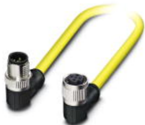
Sensor/actuator cable, 5-position, PVC, yellow, Plug angled M12 SPEEDCON, A-coded, on Socket angled M12 SPEEDCON, A-coded, cable length: 1.5 m

Please be informed that the data shown in this PDF Document is generated from our Online Catalog. Please find the complete data in the user's documentation. Our General Terms of Use for Downloads are valid ( http://phoenixcontact.com/download )