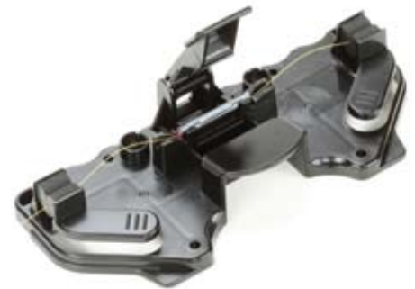
3M™ Fibrlok™ Splicing Tool