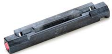
3M™ Fibrlok™ 250 µm Fiber Splice

The simple, rugged 3M™ Fibrlok™ Splicing Tool is inexpensive and portable. It requires no electrical power and can be used in any environment. Several crews can be equipped for less than the cost of a single fusion splicer.