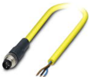
Sensor/actuator cable, 3-position, PVC, yellow, Plug straight M8, on free cable end, cable length: 10 m

Please be informed that the data shown in this PDF Document is generated from our Online Catalog. Please find the complete data in the user's documentation. Our General Terms of Use for Downloads are valid ( http://phoenixcontact.com/download )