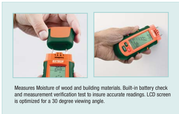
Measures Moisture of wood and building materials. Built-in battery check and measurement verification test to insure accurate readings. LCD screen is optimized for a 30 degree viewing angle.