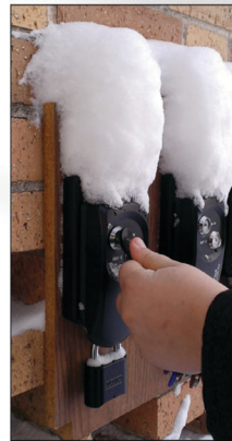
Clocking in after a blizzard.