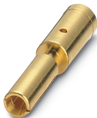
Crimp contact, turned, contact diameter: 1 mm, crimp range: 1 mm 2 ... 1.5 mm 2

Please be informed that the data shown in this PDF Document is generated from our Online Catalog. Please find the complete data in the user's documentation. Our General Terms of Use for Downloads are valid ( http://phoenixcontact.com/download )