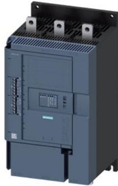
SIRIUS soft starter 200-600 V 210 A, 110-250 V AC Screw terminals Analog output