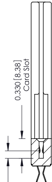
0.125 [3.18] Point of Contact — SECTION A-A

See Accompanying Page for: • Mounting Options