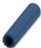
Insulating sleeve, color: blue