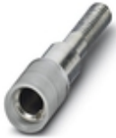
Female test connector, color: gray

Female test connector - PSBJ 4/15/6 GY - 0303396