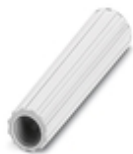
Insulating sleeve, color: white