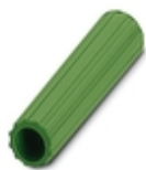
Insulating sleeve, color: green