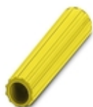
Insulating sleeve, color: yellow