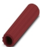
Insulating sleeve, color: red