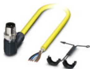
Sensor/actuator cable, 5-position, PVC, yellow, shielded, Plug angled M12 SPEEDCON, A-coded, on free cable end, cable length: 2 m

Please be informed that the data shown in this PDF Document is generated from our Online Catalog. Please find the complete data in the user's documentation. Our General Terms of Use for Downloads are valid ( http://phoenixcontact.com/download )