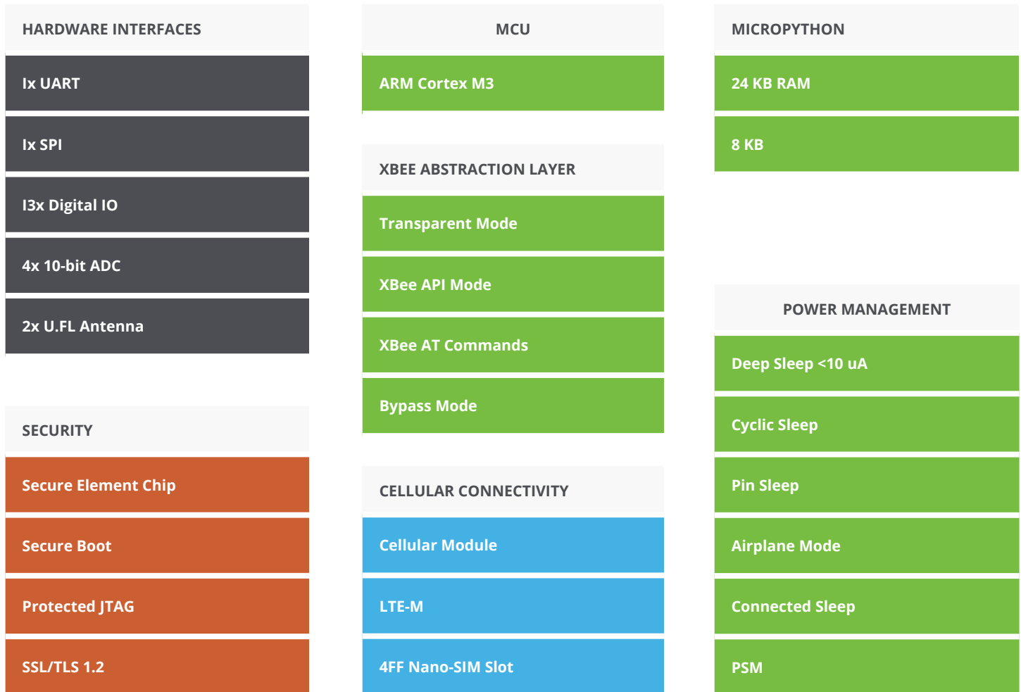
FIGURE 1: DIGI XBEE3 CELLULAR LTE-M BLOCK DIAGRAM