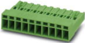
The illustration shows a 15-position version

Plug component, Nominal current: 12 A, Rated voltage (III/2): 320 V, Number of positions: 19, Pitch: 5.08 mm, Connection method: Crimp connection, Color: green, Corresponding female crimp contacts with current [A] and conductor cross section range [mm 2 ] data: 10A/MSTBC-MT 0,5-1,0 (3190564); 10A/MSTBC-MT 0,5-1,0 BA (3190645); 12A/MSTBC-MT 1,5-2,5 (3190551); 12A/MSTBC-MT 1,5-2,5 BA (3190658). BA = Bandkontakte