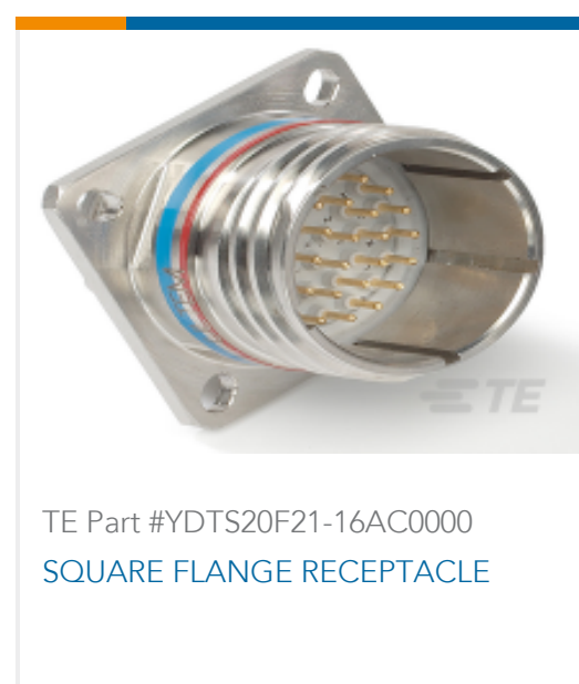
TE Part #YDTS20F21-16AC0000 SQUARE FLANGE RECEPTACLE