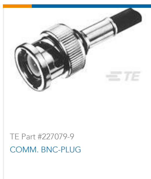
TE Part #227079-9 COMM. BNC-PLUG