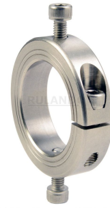
*Additional hardware NOT included