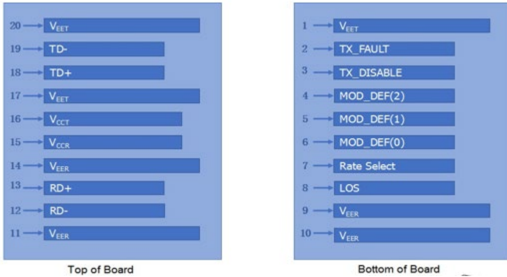
Pin-out of connector Block on Host board