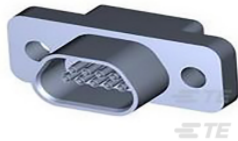
TE Part #1532177-1 M83513/04-G01N, MCKS-N1-B- 51S6G1-18.0