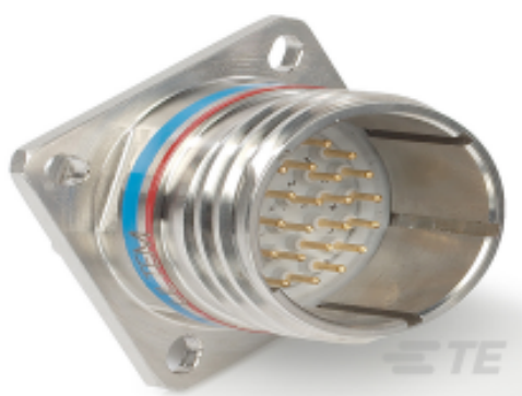
TE Part #YDTS20F21-16AC0000 SQUARE FLANGE RECEPTACLE