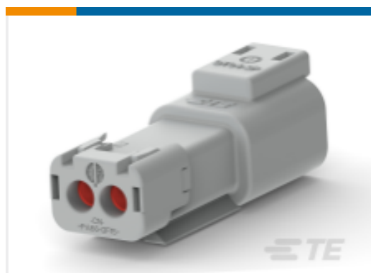
TE Part #DT04-4P-P021 DEUTSCH DT Receptacle Connectors