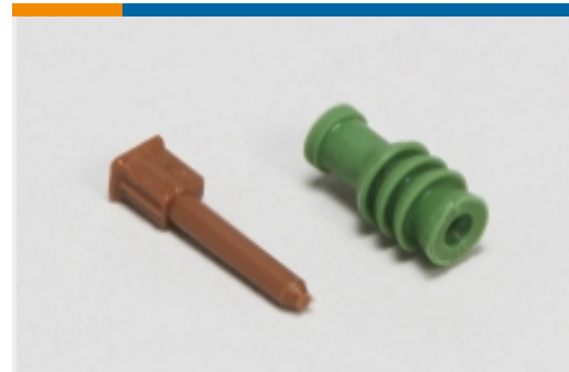
Automotive Seals & Cavity Plugs (5)