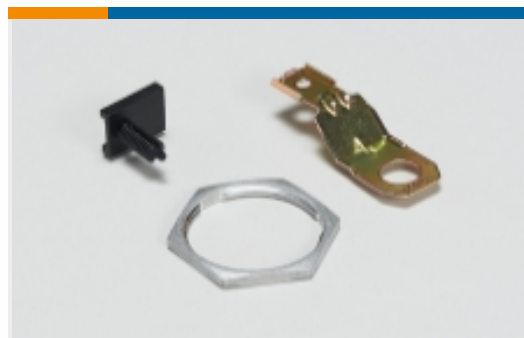
Other Automotive Connector Accessories (16)