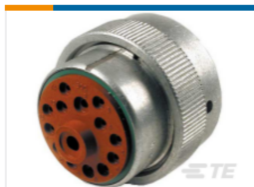
TE Part #HD36-24-14SN PLG, 14P, AL, N, 4/12/16, S