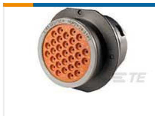
TE Part #HDP24-24-31PT REC, 31P, BLK, T, 16, P