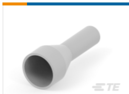
TE Part #HD10-3BT BOOT, 3P, PLG/REC, ST, GRY