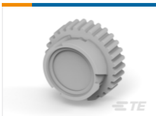
TE Part #HDC14-6 DUST CAP, 6P, PLG, GRY, HD10