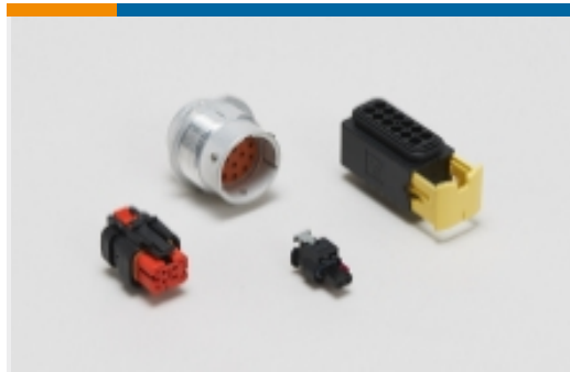
Automotive Housings (618)