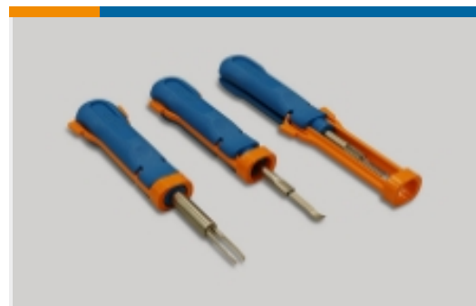
Insertion & Extraction Tools (3)