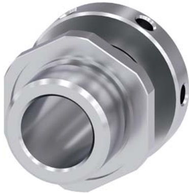
Connecting piece M20/M20 for connection of 2 enclosures, Metal, with hexagon nut