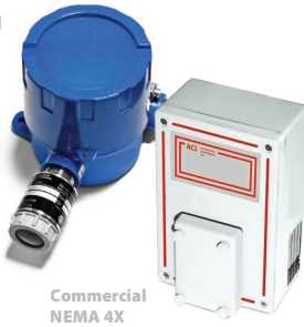
Commercial NEMA 4X