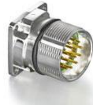
Contact Arrangement mating view