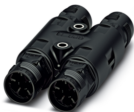
H distributor, QUICKON connection, number of positions: 4+PE, 0.5 mm 2 ... 1.5 mm 2 , 690 V, 17.5 A, black, without QUICKON nut

Please be informed that the data shown in this PDF Document is generated from our Online Catalog. Please find the complete data in the user's documentation. Our General Terms of Use for Downloads are valid ( http://phoenixcontact.com/download )