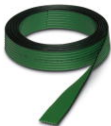
SmartWire DT™ 100 m flat-ribbon conductor, 8-pos.

Please be informed that the data shown in this PDF Document is generated from our Online Catalog. Please find the complete data in the user's documentation. Our General Terms of Use for Downloads are valid ( http://phoenixcontact.com/download )