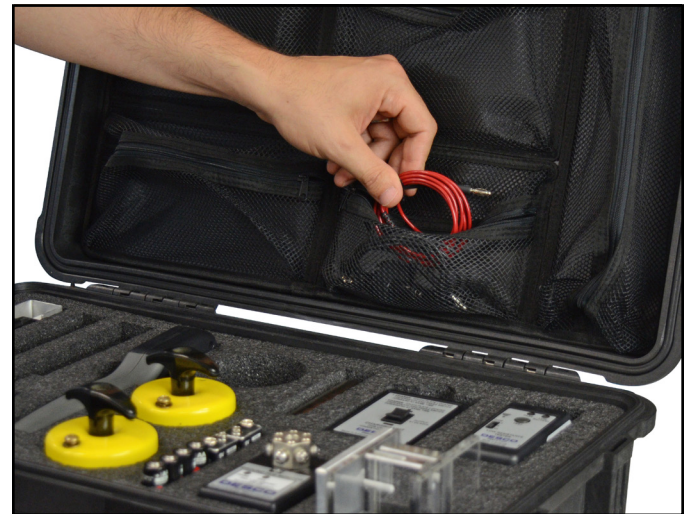
Figure 2. Using the ESD Survey Kit's lid organizer

The ESD Program Standard ANSI/ESD S20.20 can be downloaded here: https://www.esda.org/standards/esda-documents/