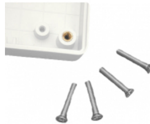
Standard models use machine screws into brass bushings. Economy models use self-tapping screws.