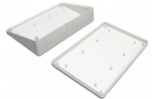
"K" sizes include PC board standoffs on both the inside top and bottom, while "E" and "H" sizes include PC board standoffs on the inside bottom. Models contain one or two removable rear panels