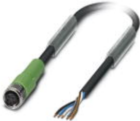
Sensor/Actuator cable, 5-position, PUR, Black-gray RAL 7021, Free cable end, on Socket straight M8, B-coded, Cable length: 3 m

Please be informed that the data shown in this PDF Document is generated from our Online Catalog. Please find the complete data in the user's documentation. Our General Terms of Use for Downloads are valid ( http://download.phoenixcontact.com )