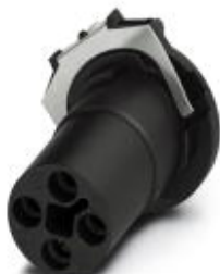
Flush-type connector, Power, 4-position, Socket, straight, M12, T power, PCB mounting, THR solder connection

Please be informed that the data shown in this PDF Document is generated from our Online Catalog. Please find the complete data in the user's documentation. Our General Terms of Use for Downloads are valid ( http://phoenixcontact.com/download )