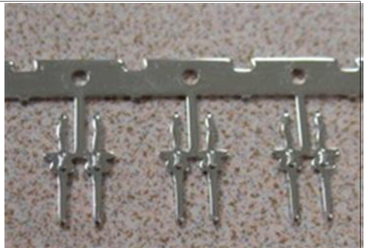
New reflowed matte tin plating