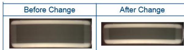
Image 2. Cross section of MLCC before and after dielectric thickness change

In addition, dielectric thickness has been changed to reduce overall chip thickness. Internal design has been maintained. Image 2 illustrates dielectric thickness change: