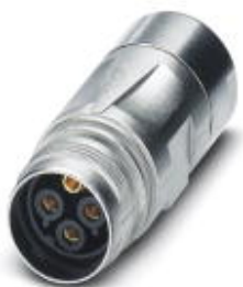
Coupler connector, straight, for standard and SPEEDCON interlock, M17, number of positions: 6+PE, type of contact: Socket, Crimp connection, shielded: yes, cable diameter range: 5 mm ... 9.2 mm

Please be informed that the data shown in this PDF Document is generated from our Online Catalog. Please find the complete data in the user's documentation. Our General Terms of Use for Downloads are valid ( http://phoenixcontact.com/download )