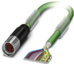
Cable plug in molded plastic, Length: 5 m, Color of outer sheath: green

Please be informed that the data shown in this PDF Document is generated from our Online Catalog. Please find the complete data in the user's documentation. Our General Terms of Use for Downloads are valid ( http://phoenixcontact.com/download )