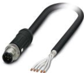
Sensor/actuator cable, 5-position, PE-X halogen-free, black, shielded, Plug straight M12 SPEEDCON, A-coded, on free cable end, cable length: 2 m, For railway applications

Please be informed that the data shown in this PDF Document is generated from our Online Catalog. Please find the complete data in the user's documentation. Our General Terms of Use for Downloads are valid ( http://phoenixcontact.com/download )