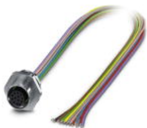
Flush-type connector, Universal, 17-position, Socket, M12, A-coded, Front mounting, M16 x 1.5, Individual wires, cable length: 0.5 m

Please be informed that the data shown in this PDF Document is generated from our Online Catalog. Please find the complete data in the user's documentation. Our General Terms of Use for Downloads are valid ( http://phoenixcontact.com/download )