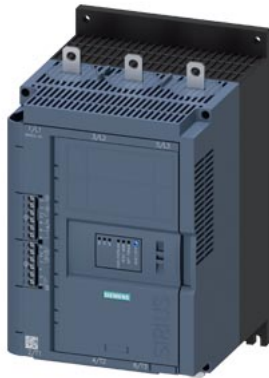
SIRIUS soft starter 200-600 V 113 A, 24 V AC/DC Screw terminals Thermistor input