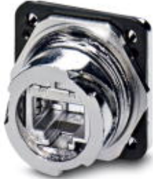
RJ45 mounting frame, IP67, for bayonet interlocking, metal, with socket-socket contact insert, for round mounting cutout, with seal, without mounting screws

Please be informed that the data shown in this PDF Document is generated from our Online Catalog. Please find the complete data in the user's documentation. Our General Terms of Use for Downloads are valid ( http://download.phoenixcontact.com )